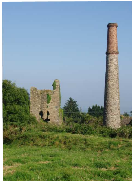
East Kit Hill Mine from north, 13 July 2005

For more details Contact: Bill Watson 370715