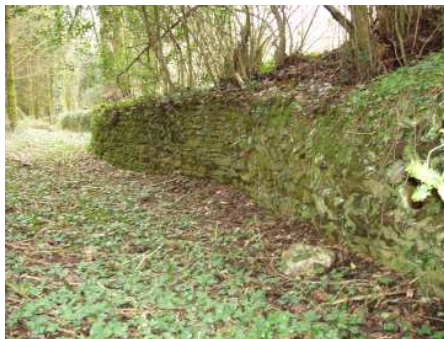
The wall at the foot of the valley slope running parallel to the stream past Jopes Cottage, February 2005

At the bottom of the valley slopes, on both sides, there are continuous, sinuous walls which we inspected. Along the Jopes Cottage southern boundary there used to be a mill leat, but no such feature would explain the wall on the other side of the stream. Also we thought that we had found signs of the leat on higher